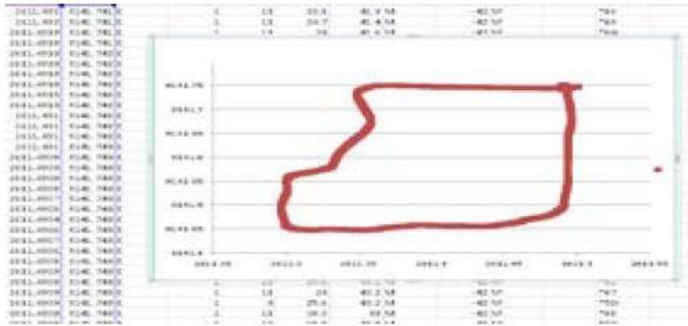
Figure 2: Excel graph

That graph has shown the route or path in which we traveled as shown in Figure 2 and Figure 3.