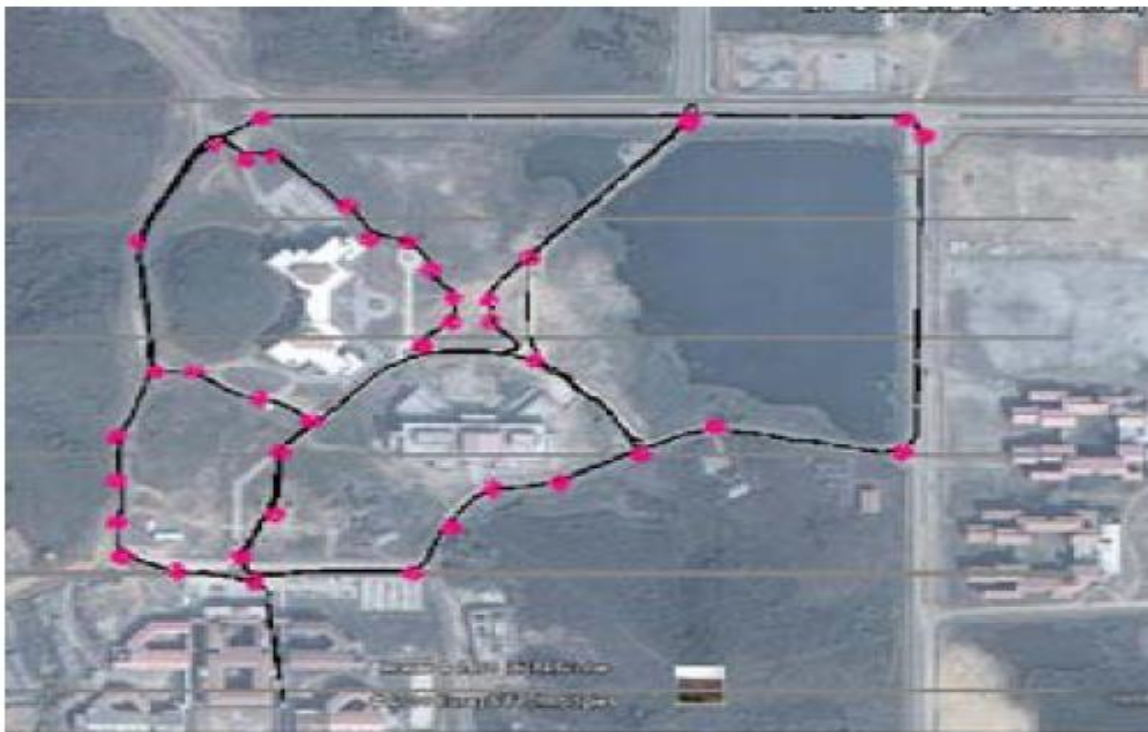
Figure 4: Selecting Way point

The algorithm follows Dijkstra's shortest path algorithm until it finds a vertex with destination vertex. Once it finds the destination vertex while executing the Dijkstra's algorithm then it will break from the loop. Then it saves the previous vertex list of the destination vertex. This previous vertex list shows the shortest path. This previous vertices list is saved in an array. From this array the first two vertices are taken out and initialized as the Start and End vertices. The line L is the line formed by these two vertices. Let us say S1 is the point on the path. D1 is the distance from the point S1 to the line L . This D1 is used to check whether the point S1 is inside the road or outside the road. De[k] is the distance between S1 and the End point. This is used to check whether we are moving in the right direction or not. And also used to check whether we reached the end point or not. If we reach the end point then De[k] must be less than M where M is some constant and radius of the circle near the End point. After we reached the end point then we have to change the End point as the Start point and incrementing the End point by one. It goes until we reached the destination.